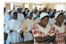
“...all of us committed to the worldwide mission of Jesus.”